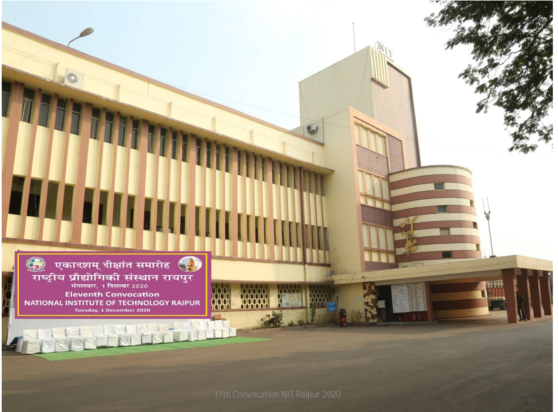
11th Convocation NIT Raipur 2020