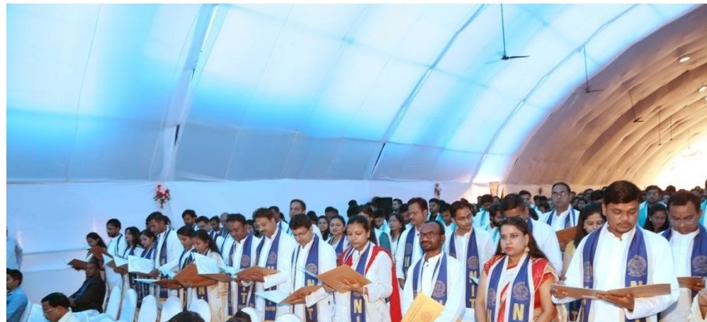
11th Convocation NIT Raipur 2020

The Respective Department Graduates Shall rise During Conferment of Degrees.