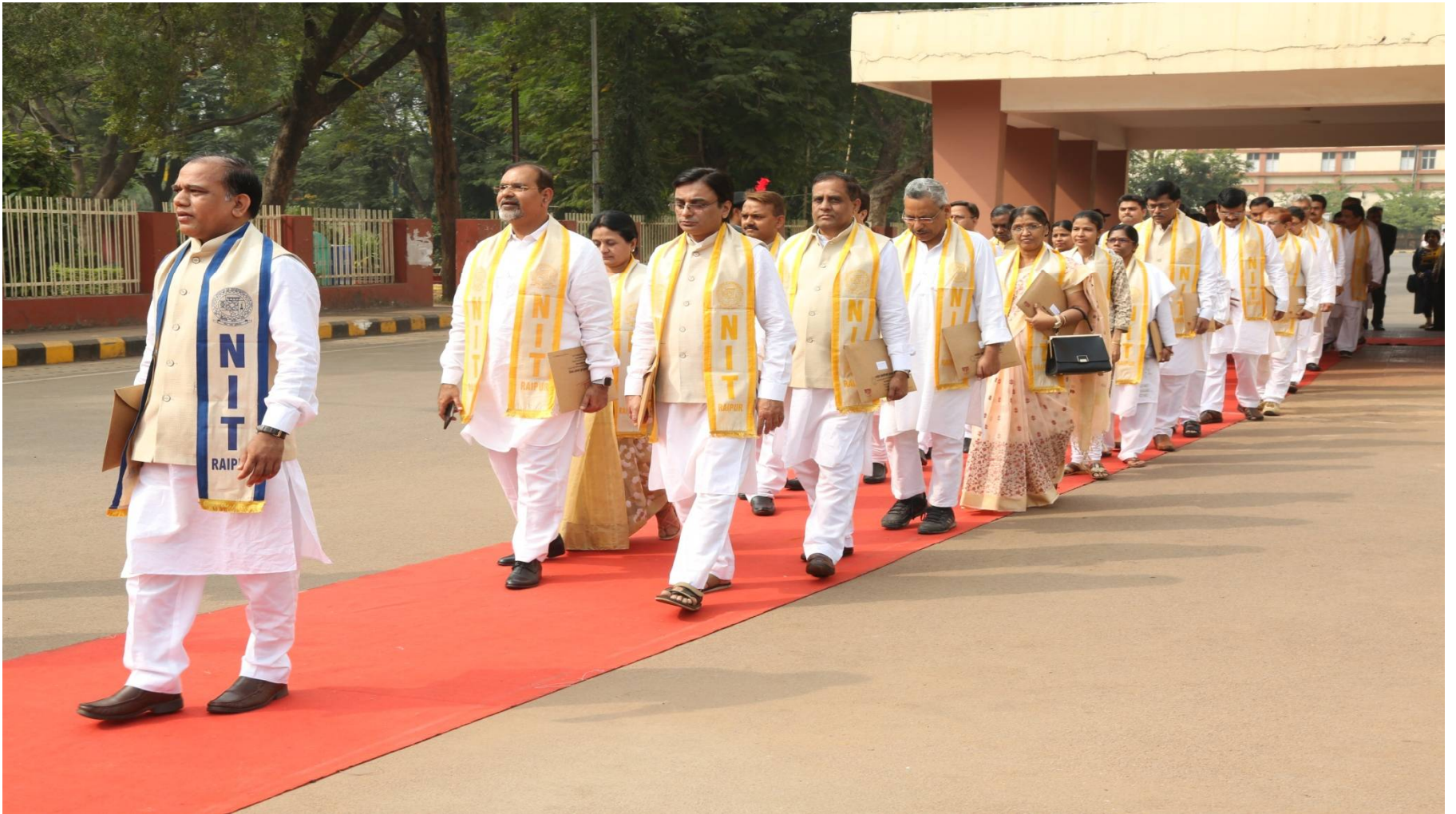
11th Convocation NIT Raipur 2020